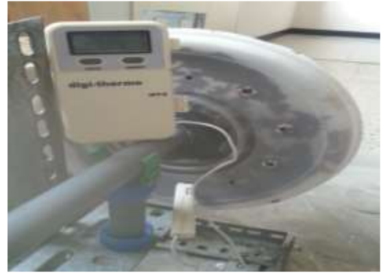
Figure (2). Rotary unit.

Analyses methods [16, 17] were done according to the American standard of wood end research laboratory of Ohio State, which is involved in experimental composting process as shown below: