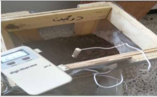
Figure (1). Stationary unit.