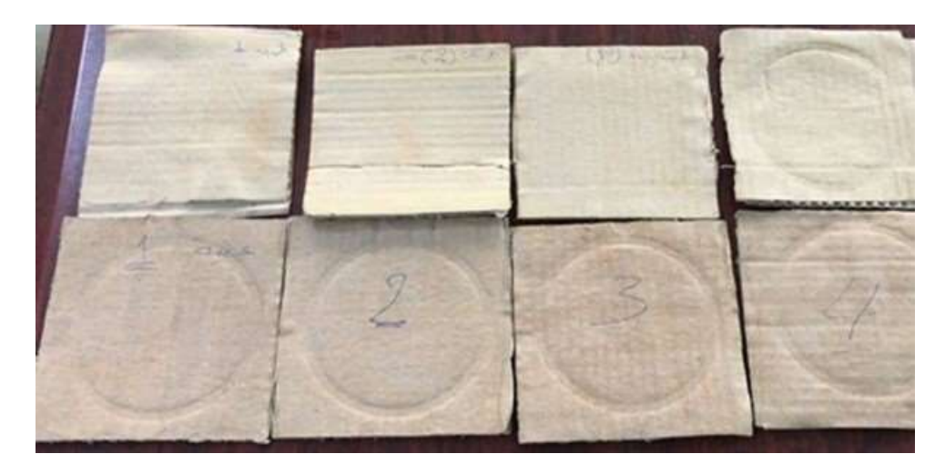
Figure (1). The shape of the carton samples with and without coating.

The experiential results have been obtained in Table (1) which show the soaking ratio of carton (paperboard is in corrugated paperboard packages), where the Figure (1) show with the upper row the coating with single layer while the second row show the samples coated with two faces.